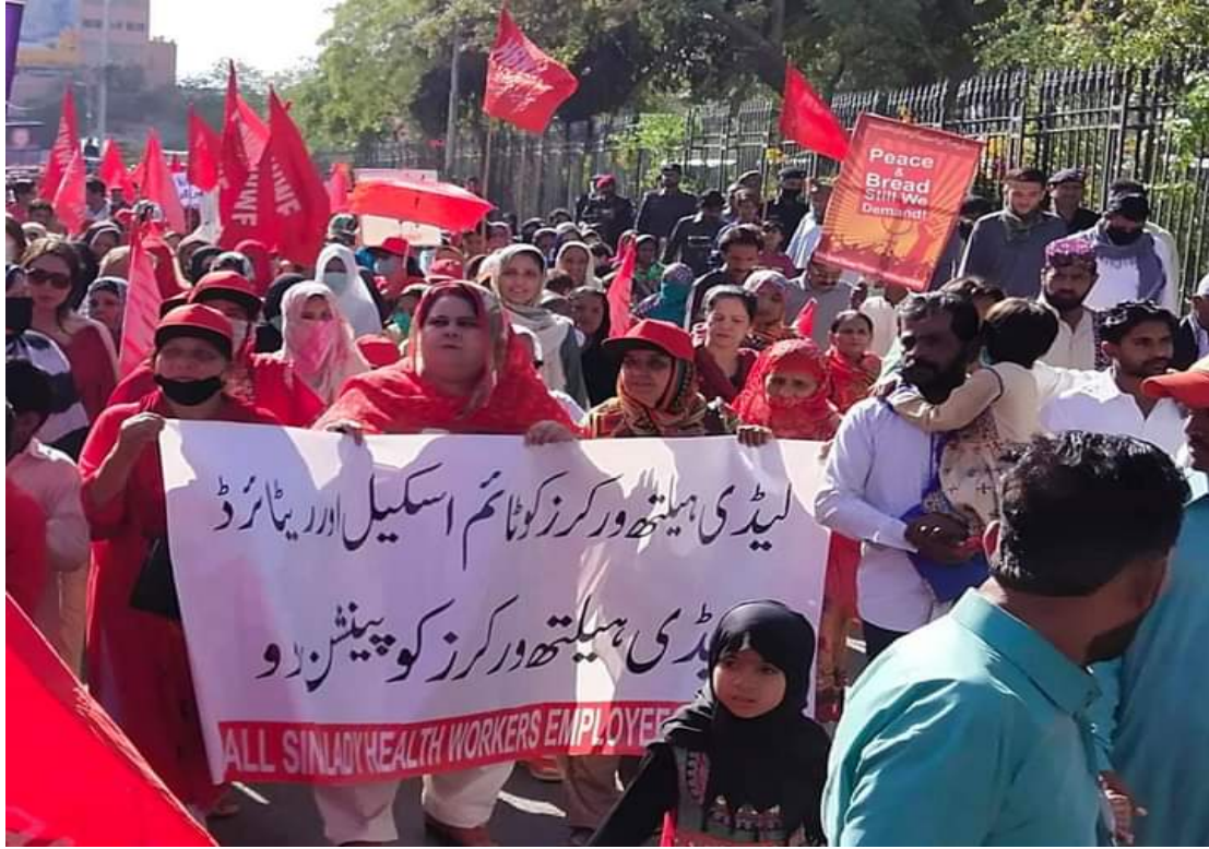
Health workers' protest October 2020