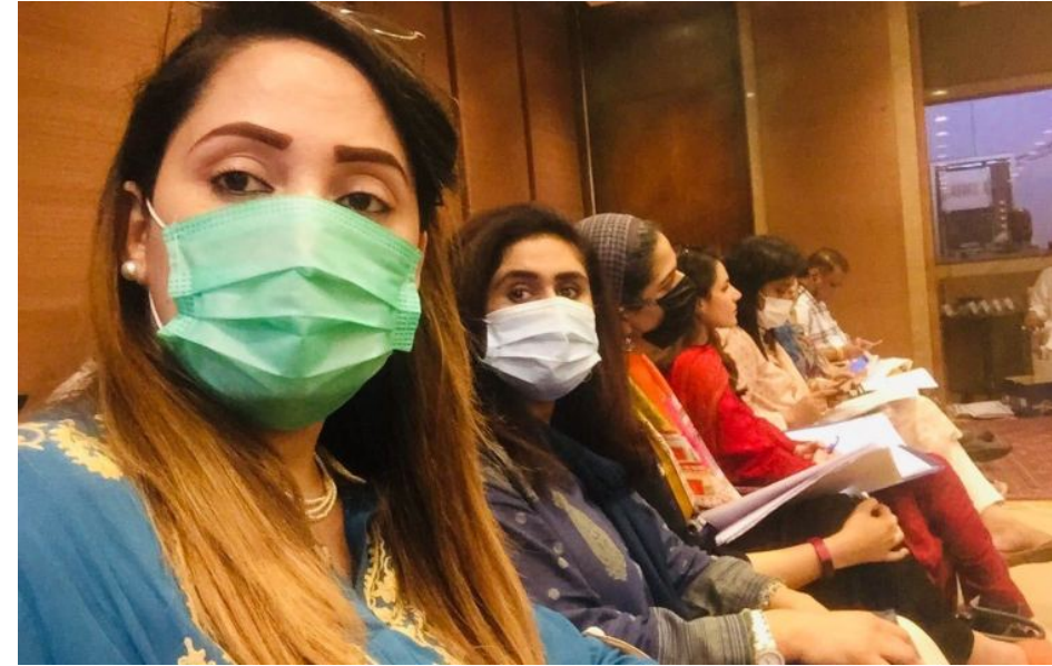
Women journalists at a hearing on online abuse against female journalists at the Human Rights Committee of Pakistan's National Assembly.

"Women in the media, especially those on social media platforms, are finding it increasingly difficult to remain on these platforms and engage freely. Many now self-censor, refrain from sharing information, giving their opinion or actively engaging online."