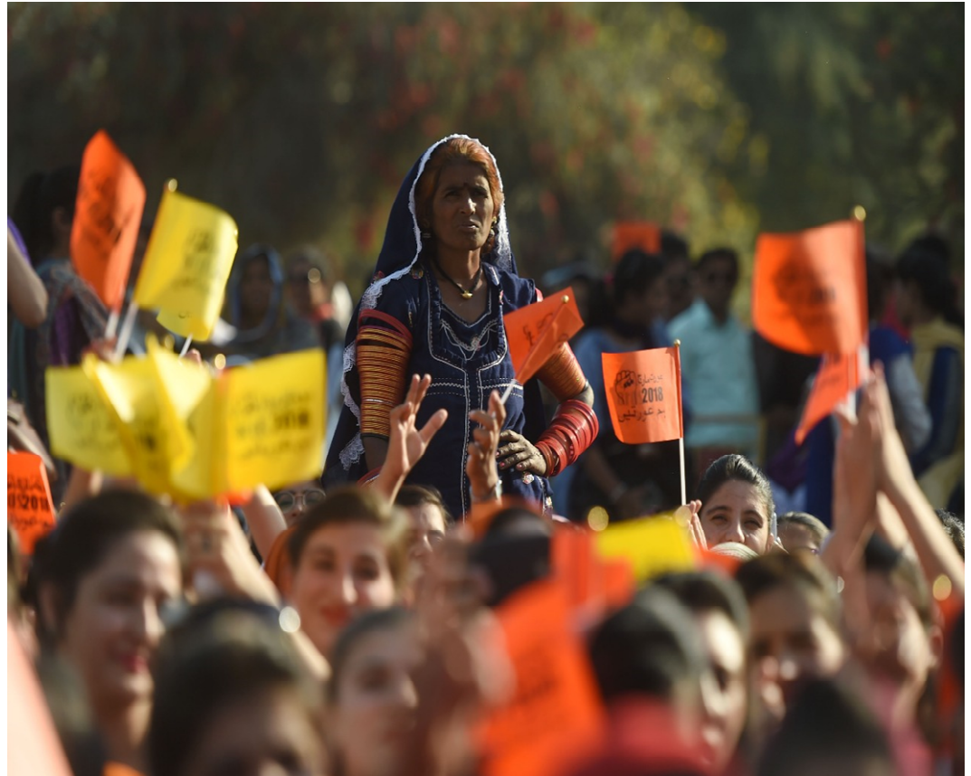
(Aurat March, Karachi, 8 March 2018.)

Despite all of this, gender-based resistance continues in multiple forms throughout the country. The following section documents some recent instances of activism amongst women and transgender communities that persist despite varying degrees of state/military repression.