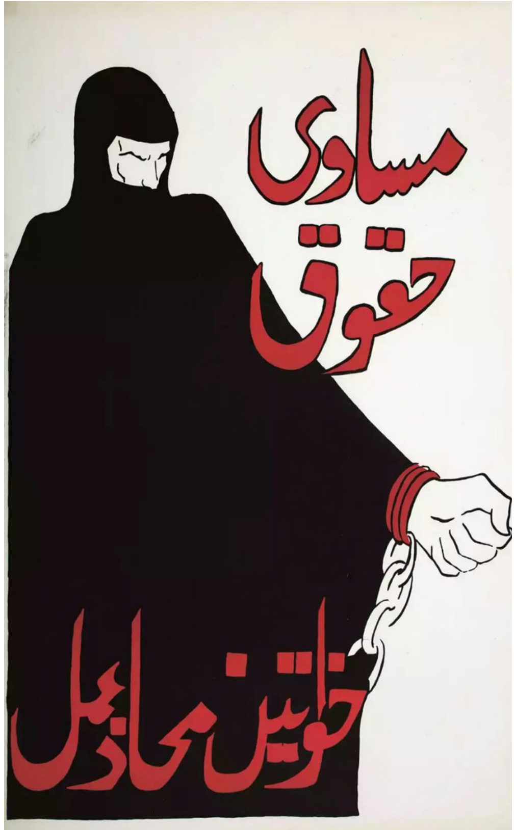
(WAF Poster. Artist: Lala Rukh)

WAF, which spearheaded the modern rights-based women's movement, was established in 1981 as a platform to organise against Zia's Islamisation programme. WAF maintained a publicly ambiguous position vis-à-vis its